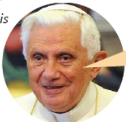
Pope Benedict XVI

"The Charismatic Renewal ... is a current of grace, a renewing breath of the spirit for all members of the Church."