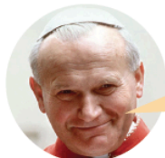
Pope John Paul II

"Let us rediscover, dear brothers and sisters, the beauty of being baptized in the Holy Spirit..."